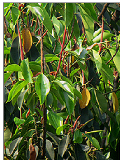
Indian Laurel Fig foliage