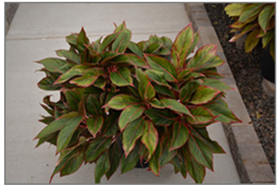
Siam Aurora Chinese Evergreen