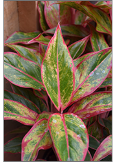
Siam Aurora Chinese Evergreen

This is an herbaceous houseplant with an upright spreading habit of growth. This plant may benefit from an occasional pruning to look its best.