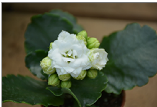
Calandiva White Kalanchoe flowers