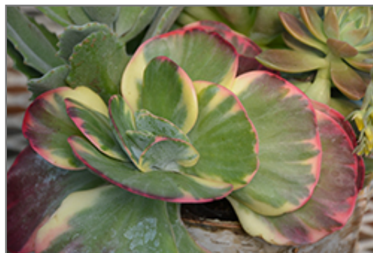
Fantastic Variegated Paddle Plant foliage

When grown indoors, Fantastic Variegated Paddle Plant can be expected to grow to be about 10 inches tall at maturity extending to 24 inches tall with the flowers, with a spread of 10 inches. It grows at a slow rate, and under ideal conditions can be expected to live for approximately 10 years. This houseplant will do well in a location that gets either direct or indirect sunlight, although it will usually require a more brightly-lit environment than what artificial indoor lighting alone can provide. It is very adaptable to both dry and moist soil, and should do just fine under average home conditions. The surface of the soil shouldn't be allowed to dry out completely, and so you should expect to water this plant once and possibly even twice each week. Be aware that your particular watering schedule may vary depending on its location in the room, the pot size, plant size and other conditions; if in doubt, ask one of our experts in the store for advice. It is not particular as to soil pH, but grows best in sandy soil. Contact the store for specific recommendations on pre-mixed potting soil for this plant.