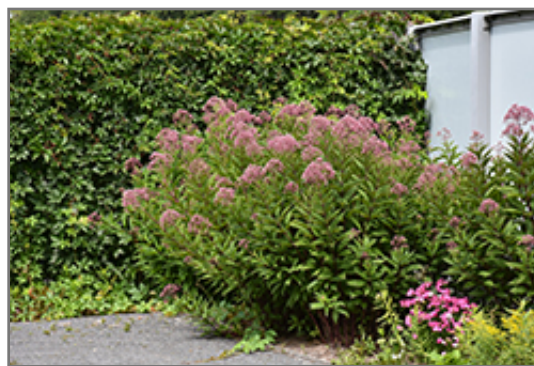
Gateway Joe Pye Weed in bloom