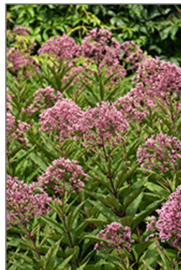
Gateway Joe Pye Weed flowers

This is a relatively low maintenance plant, and is best cleaned up in early spring before it resumes active growth for the season. It is a good choice for attracting butterflies to your yard, but is not particularly attractive to deer who tend to leave it alone in favor of tastier treats. It has no significant negative characteristics.