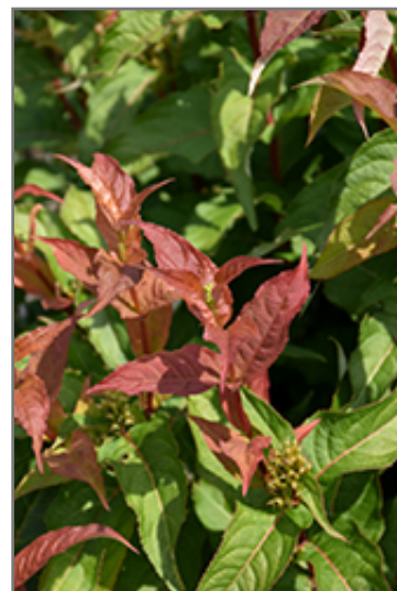
Kodiak Orange Diervilla foliage

Kodiak Orange Diervilla is recommended for the following landscape applications;