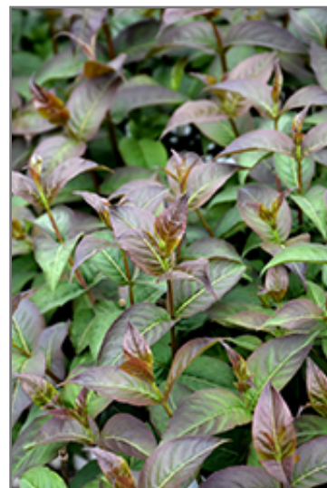
Kodiak Black Diervilla foliage

Kodiak Black Diervilla makes a fine choice for the outdoor landscape, but it is also well-suited for use in outdoor pots and containers. Because of its height, it is often used as a 'thriller' in the 'spiller-thriller-filler' container combination; plant it near the center of the pot, surrounded by smaller plants and those that spill over the edges. It is even sizeable enough that it can be grown alone in a suitable container. Note that when grown in a container, it may not perform exactly as indicated on the tag - this is to be expected. Also note that when growing plants in outdoor containers and baskets, they may require more frequent waterings than they would in the yard or garden.