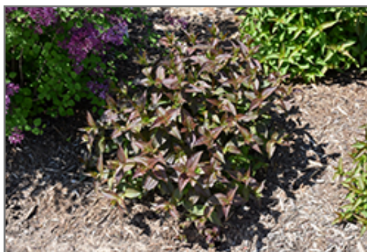
Kodiak Black Diervilla