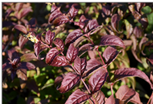
Kodiak Black Diervilla foliage