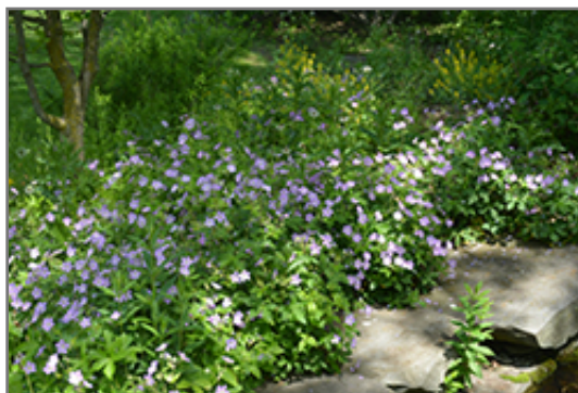
Spotted Cranesbill in bloom

Spotted Cranesbill will grow to be about 24 inches tall at maturity, with a spread of 24 inches. When grown in masses or used as a bedding plant, individual plants should be spaced approximately 20 inches apart. Its foliage tends to remain dense right to the ground, not requiring facer plants in front. It grows at a medium rate, and under ideal conditions can be expected to live for approximately 10 years. As an herbaceous perennial, this plant will usually die back to the crown each winter, and will regrow from the base each spring. Be careful not to disturb the crown in late winter when it may not be readily seen!