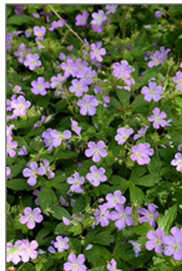
Spotted Cranesbill flowers