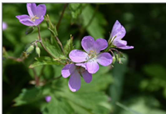
Spotted Cranesbill flowers