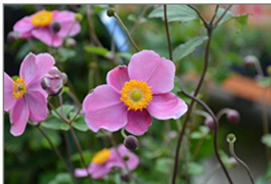
September Charm Anemone flowers

September Charm Anemone is recommended for the following landscape applications;