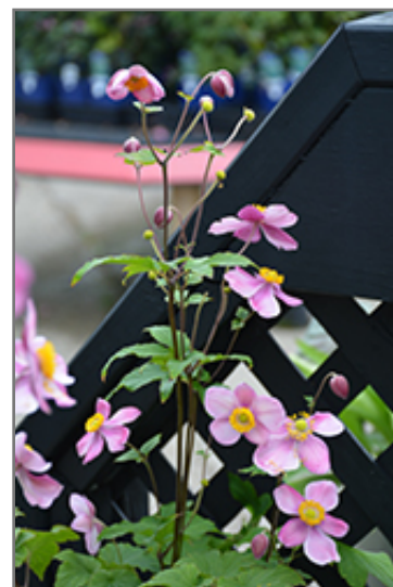
September Charm Anemone flowers