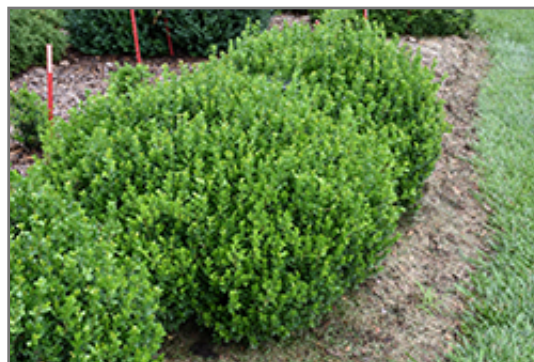
Sprinter Boxwood

Sprinter Boxwood is recommended for the following landscape applications;