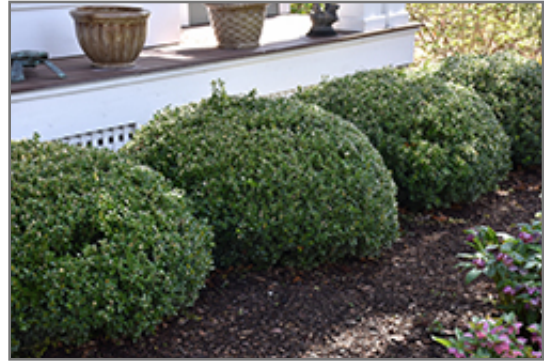
Sprinter Boxwood

Sprinter Boxwood will grow to be about 4 feet tall at maturity, with a spread of 4 feet. It tends to fill out right to the ground and therefore doesn't necessarily require facer plants in front. It grows at a fast rate, and under ideal conditions can be expected to live for approximately 30 years.