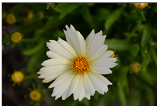
UpTick Cream Tickseed flowers