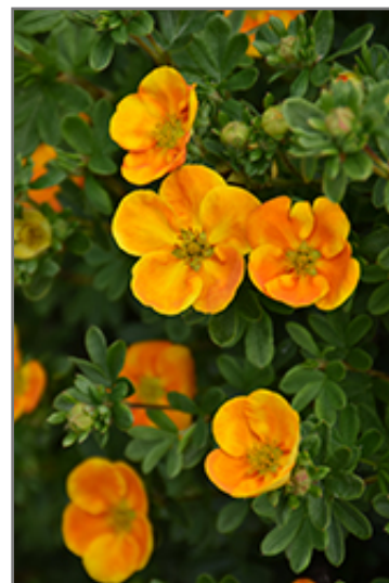
Mandarin Tango Potentilla flowers