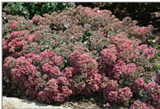
Popstar Stonecrop in bloom