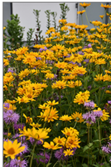
Summer Sun False Sunflower flowers