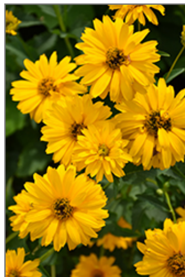
Summer Sun False Sunflower flowers

Summer Sun False Sunflower is recommended for the following landscape applications;