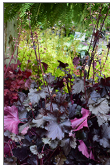
Black Pearl Coral Bells in bloom

Black Pearl Coral Bells is recommended for the following landscape applications;