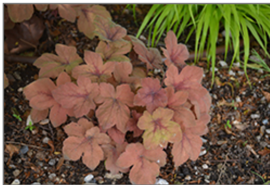
Pumpkin Spice Foamy Bells