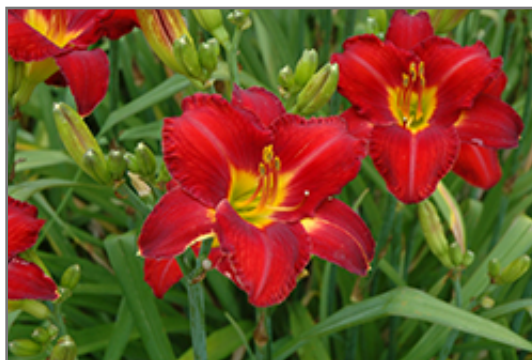
Chicago Apache Daylily flowers

Rich scarlet red flowers with slightly ruffled edges bloom during the mid summer months; tall flower stalks rise above mounds of green arching foliage; an elegant addition to borders, beds and containers; low maintenance and drought tolerant