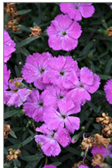
Paint The Town Fuchsia Pinks flowers

This is a relatively low maintenance plant, and is best cleaned up in early spring before it resumes active growth for the season. It is a good choice for attracting bees and butterflies to your yard, but is not particularly attractive to deer who tend to leave it alone in favor of tastier treats. It has no significant negative characteristics.