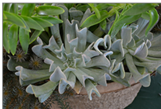
Topsy Turvy Echeveria

This is a dense herbaceous evergreen houseplant with tall flower stalks held atop a low mound of foliage. Its relatively fine texture sets it apart from other indoor plants with less refined foliage. This plant should not require much pruning, except when necessary to keep it looking its best.