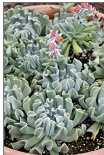
Topsy Turvy Echeveria in bloom

This is a dense herbaceous evergreen houseplant with tall flower stalks held atop a low mound of foliage. Its relatively fine texture sets it apart from other indoor plants with less refined foliage. This plant should not require much pruning, except when necessary to keep it looking its best.