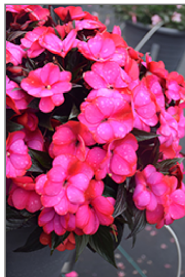
Infinity Blushing Lilac New Guinea Impatiens flowers

Infinity Blushing Lilac New Guinea Impatiens is recommended for the following landscape applications;