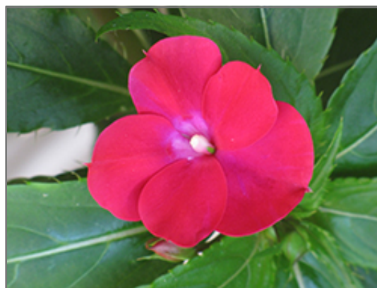
Infinity Cherry Red New Guinea Impatiens flowers