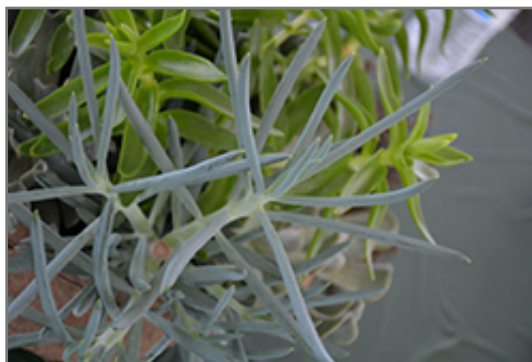
Serpents Blue Chalk Fingers

When grown indoors, Serpents Blue Chalk Fingers can be expected to grow to be about 18 inches tall at maturity extending to 24 inches tall with the flowers, with a spread of 18 inches. It grows at a medium rate, and under ideal conditions can be expected to live for approximately 10 years. This houseplant will do well in a location that gets either direct or indirect sunlight, although it will usually require a more brightly-lit environment than what artificial indoor lighting alone can provide. It prefers dry to average moisture levels with very well-drained soil, and may die if left in standing water for any length of time. This plant should be watered when the surface of the soil gets dry, and will need watering approximately once each week. Be aware that your particular watering schedule may vary depending on its location in the room, the pot size, plant size and other conditions; if in doubt, ask one of our experts in the store for advice. It is not particular as to soil type or pH; an average potting soil should work just fine.