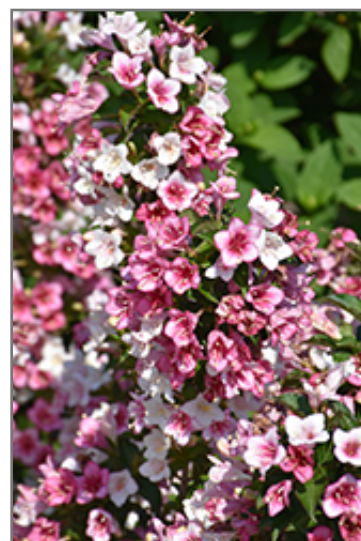
Czechmark Trilogy Weigela flowers