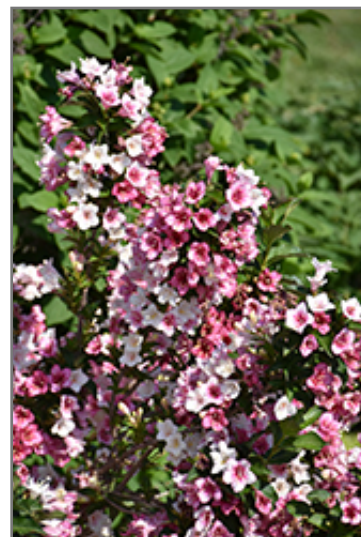
Czechmark Trilogy Weigela flowers

This shrub should only be grown in full sunlight. It prefers to grow in average to moist conditions, and shouldn't be allowed to dry out. It is not particular as to soil type or pH. It is highly tolerant of urban pollution and will even thrive in inner city environments. This is a selected variety of a species not originally from North America.