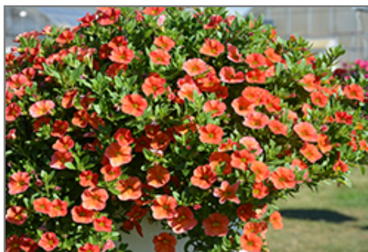
Cabaret Orange Calibrachoa in bloom