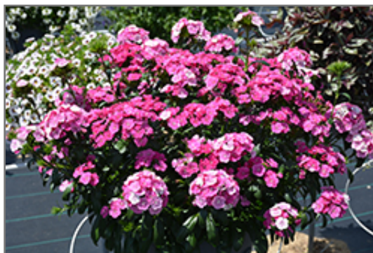
Jolt Pink Magic Pinks in bloom

Jolt Pink Magic Pinks will grow to be about 16 inches tall at maturity, with a spread of 15 inches. When grown in masses or used as a bedding plant, individual plants should be spaced approximately 12 inches apart. Its foliage tends to remain dense right to the ground, not requiring facer plants in front. Although it's not a true annual, this plant can be expected to behave as an annual in our climate if left outdoors over the winter, usually needing replacement the following year. As such, gardeners should take into consideration that it will perform differently than it would in its native habitat.