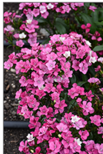
Jolt Pink Magic Pinks flowers

This is a relatively low maintenance plant, and is best cleaned up in early spring before it resumes active growth for the season. It is a good choice for attracting bees and butterflies to your yard, but is not particularly attractive to deer who tend to leave it alone in favor of tastier treats. It has no significant negative characteristics.