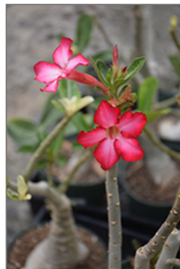
Desert Rose flowers