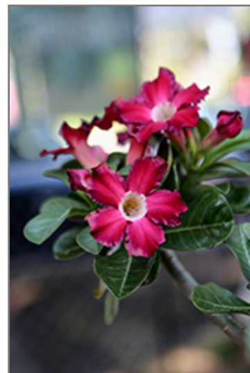
Desert Rose flowers