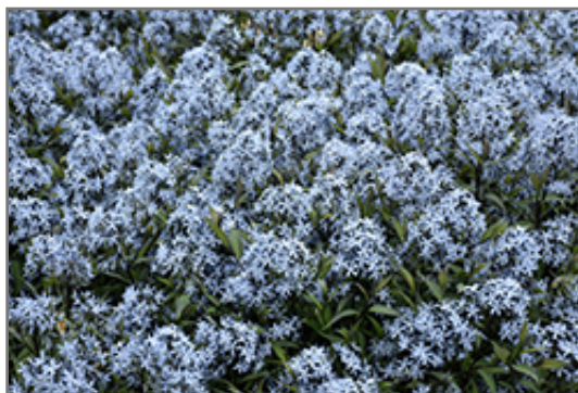
Storm Cloud Bluestar flowers

This plant does best in full sun to partial shade. It prefers to grow in average to moist conditions, and shouldn't be allowed to dry out. It is not particular as to soil type or pH. It is somewhat tolerant of urban pollution. This is a selection of a native North American species. It can be propagated by cuttings; however, as a cultivated variety, be aware that it may be subject to certain restrictions or prohibitions on propagation.