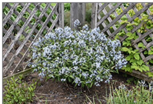
Storm Cloud Bluestar in bloom