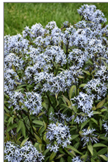
Storm Cloud Bluestar flowers

This is a relatively low maintenance plant, and should be cut back in late fall in preparation for winter. Deer don't particularly care for this plant and will usually leave it alone in favor of tastier treats. It has no significant negative characteristics.