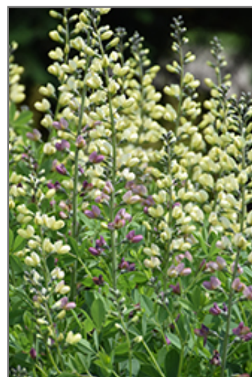
Decadence Deluxe Pink Lemonade False Indigo flowers