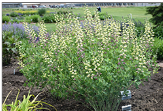
Decadence Deluxe Pink Lemonade False Indigo in bloom

Decadence Deluxe Pink Lemonade False Indigo will grow to be about 4 feet tall at maturity, with a spread of 4 feet. It tends to be leggy, with a typical clearance of 1 foot from the ground, and should be underplanted with lower-growing perennials. It grows at a slow rate, and under ideal conditions can be expected to live for approximately 25 years. As an herbaceous perennial, this plant will usually die back to the crown each winter, and will regrow from the base each spring. Be careful not to disturb the crown in late winter when it may not be readily seen!