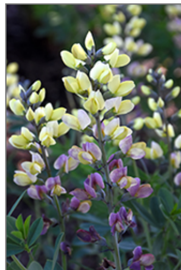
Decadence Deluxe Pink Lemonade False Indigo flowers

This is a relatively low maintenance plant, and is best cleaned up in early spring before it resumes active growth for the season. It is a good choice for attracting bees and butterflies to your yard. It has no significant negative characteristics.