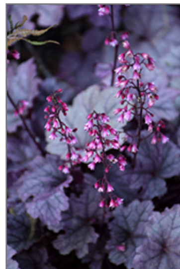
Pink Panther Coral Bells flowers

Pink Panther Coral Bells is a fine choice for the garden, but it is also a good selection for planting in outdoor pots and containers. With its upright habit of growth, it is best suited for use as a 'thriller' in the 'spiller-thriller-filler' container combination; plant it near the center of the pot, surrounded by smaller plants and those that spill over the edges. Note that when growing plants in outdoor containers and baskets, they may require more frequent waterings than they would in the yard or garden.