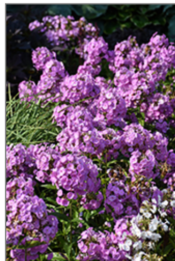
Fashionably Early Flamingo Garden Phlox flowers