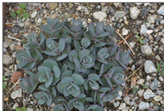
Rock 'N Grow Superstar Stonecrop