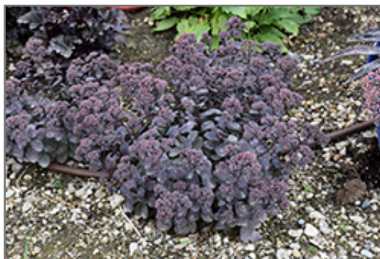
Rock 'N Grow Superstar Stonecrop in bloom