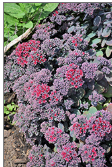
Rock 'N Grow Superstar Stonecrop flower buds

Rock 'N Grow Superstar Stonecrop is a dense herbaceous perennial with a mounded form. Its medium texture blends into the garden, but can always be balanced by a couple of finer or coarser plants for an effective composition.