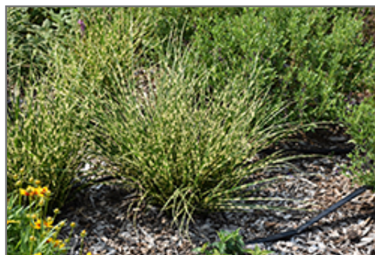
Bandwidth Maiden Grass