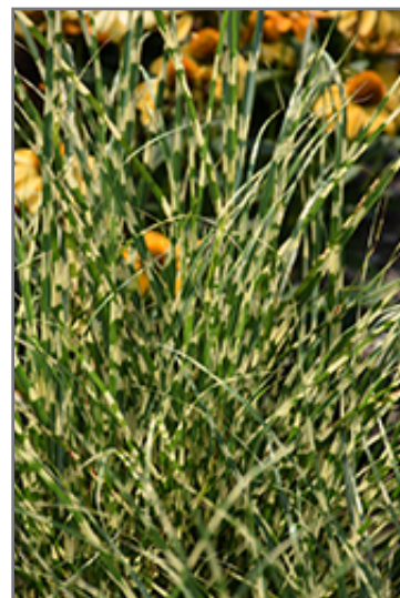
Bandwidth Maiden Grass foliage

Bandwidth Maiden Grass is recommended for the following landscape applications;