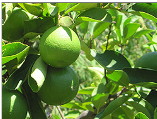
Bearss Seedless Lime fruit