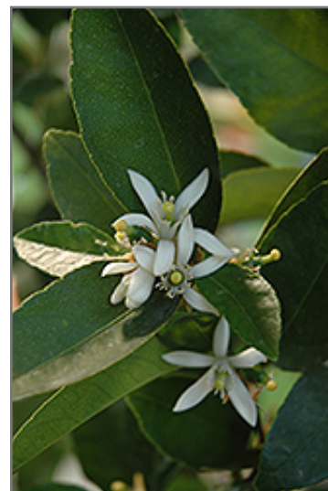
Bearss Seedless Lime flowers

This is a multi-stemmed evergreen houseplant with an upright spreading habit of growth. This plant may benefit from an occasional pruning to look its best.