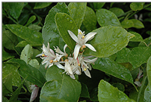
Improved Meyer Lemon flowers