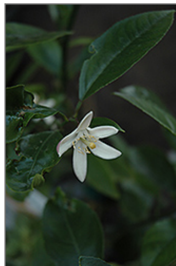
Improved Meyer Lemon flowers

This is a multi-stemmed evergreen houseplant with an upright spreading habit of growth. This plant may benefit from an occasional pruning to look its best.