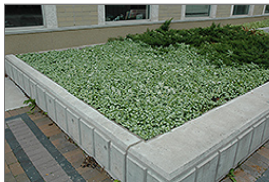
White Nancy Spotted Dead Nettle in bloom