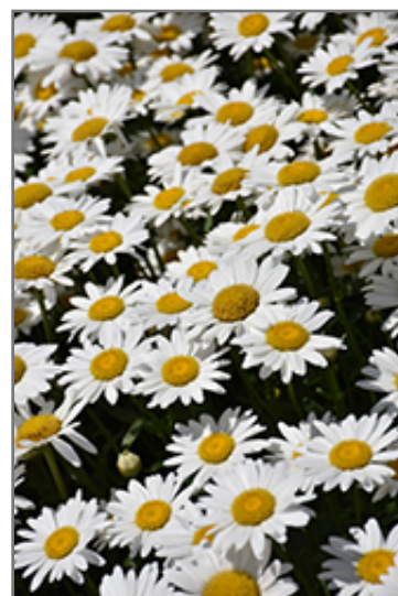
Becky Shasta Daisy flowers