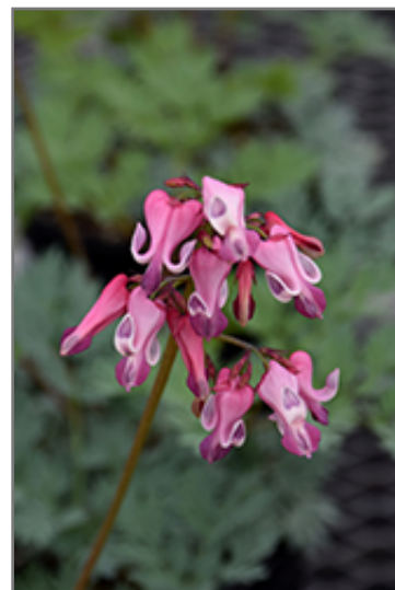
Pink Diamonds Fern-leaved Bleeding Heart flowers

Pink Diamonds Fern-leaved Bleeding Heart is a fine choice for the garden, but it is also a good selection for planting in outdoor pots and containers. It is often used as a 'filler' in the 'spiller-thriller-filler' container combination, providing a mass of flowers and foliage against which the thriller plants stand out. Note that when growing plants in outdoor containers and baskets, they may require more frequent waterings than they would in the yard or garden.