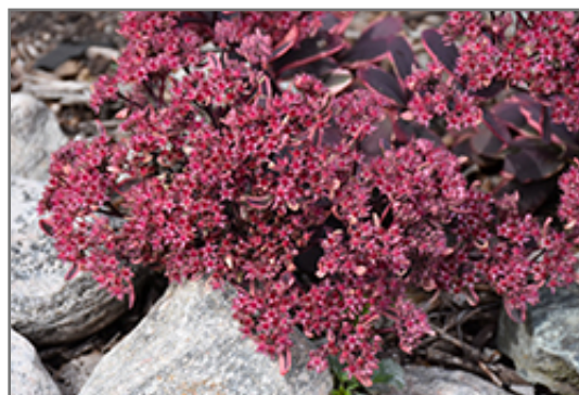
Dream Dazzler Stonecrop flowers