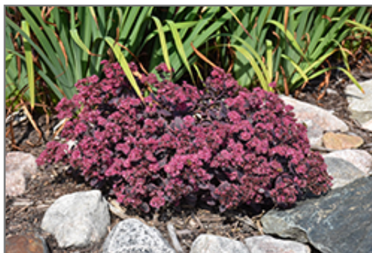
Dream Dazzler Stonecrop in bloom