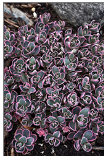
Dream Dazzler Stonecrop foliage

Dream Dazzler Stonecrop is a dense herbaceous perennial with an upright spreading habit of growth. Its medium texture blends into the garden, but can always be balanced by a couple of finer or coarser plants for an effective composition.