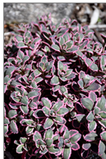
Dream Dazzler Stonecrop foliage

Dream Dazzler Stonecrop is a dense herbaceous perennial with an upright spreading habit of growth. Its medium texture blends into the garden, but can always be balanced by a couple of finer or coarser plants for an effective composition.