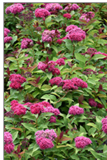
Double Play Doozie Spirea flowers