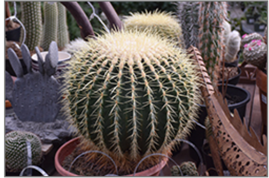
Golden Barrel Cactus in full

Golden Barrel Cactus is a succulent evergreen plant. It is a member of the cactus family, which are grown primarily for their characteristic shapes, their interesting features and textures, and their high tolerance for hot, dry growing environments. Like all cacti, it doesn't actually have leaves, but rather modified succulent stems that comprise the bulk of the plant, and which are designed to hold water for long periods of time. This particular cactus is valued for its distinctive barrel shape, and usually grows as a single spiny ribbed green stem. This plant has yellow cup-shaped flowers held atop the stems from late spring to early summer, which are interesting on close inspection.