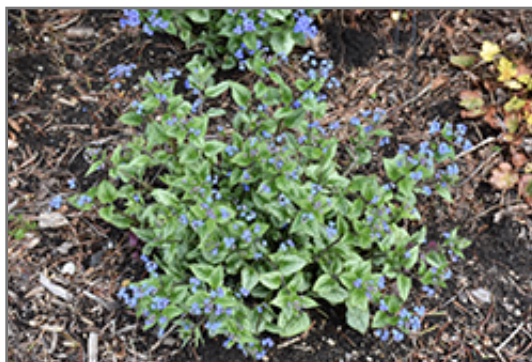
Queen of Hearts Bugloss in bloom

Queen of Hearts Bugloss will grow to be about 18 inches tall at maturity extending to 30 inches tall with the flowers, with a spread of 3 feet. When grown in masses or used as a bedding plant, individual plants should be spaced approximately 30 inches apart. It grows at a medium rate, and under ideal conditions can be expected to live for approximately 10 years. As an herbaceous perennial, this plant will usually die back to the crown each winter, and will regrow from the base each spring. Be careful not to disturb the crown in late winter when it may not be readily seen!