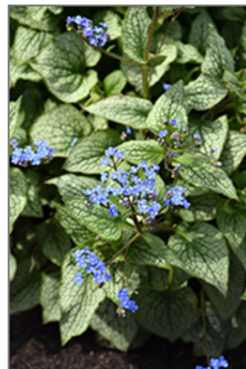
Queen of Hearts Bugloss flowers

Queen of Hearts Bugloss is recommended for the following landscape applications;