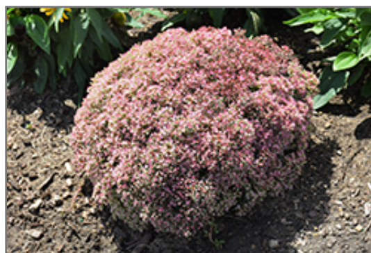
Rock 'N Round Pride and Joy Stonecrop in bloom