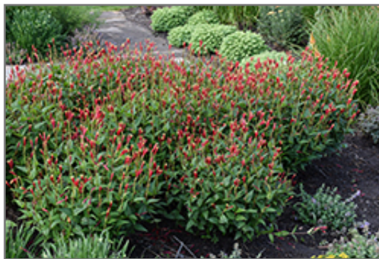
Little Redhead Indian Pink in bloom