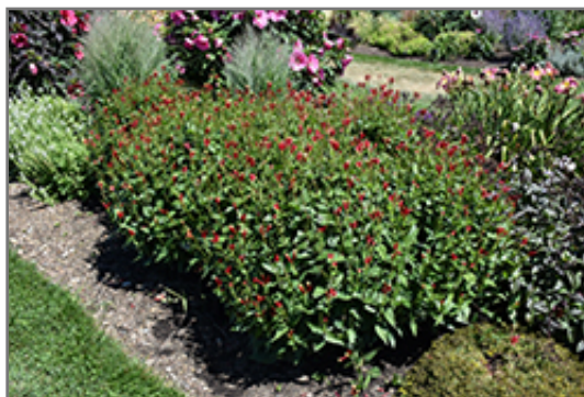
Little Redhead Indian Pink in bloom

Little Redhead Indian Pink is a fine choice for the garden, but it is also a good selection for planting in outdoor pots and containers. With its upright habit of growth, it is best suited for use as a 'thriller' in the 'spiller-thriller-filler' container combination; plant it near the center of the pot, surrounded by smaller plants and those that spill over the edges. Note that when growing plants in outdoor containers and baskets, they may require more frequent waterings than they would in the yard or garden.