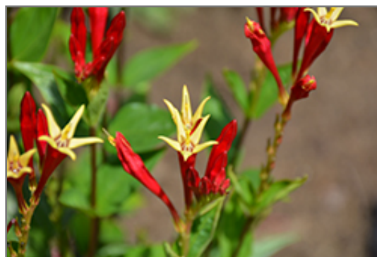
Little Redhead Indian Pink flowers