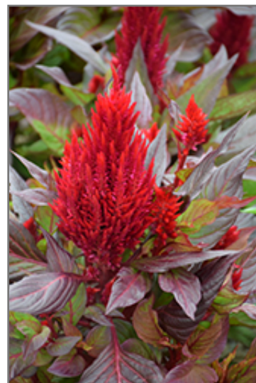
New Look Celosia flowers

New Look Celosia is recommended for the following landscape applications;