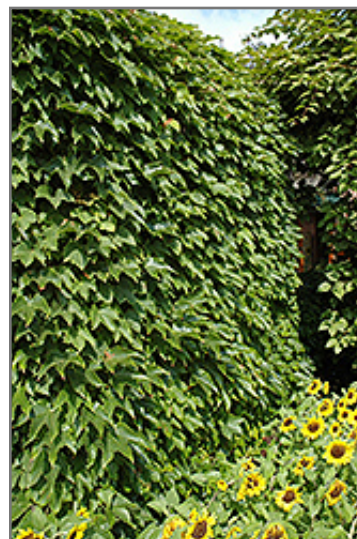
Boston Ivy

This woody vine does best in full sun to partial shade. It is very adaptable to both dry and moist locations, and should do just fine under average home landscape conditions. It is considered to be drought-tolerant, and thus makes an ideal choice for xeriscaping or the moisture-conserving landscape. It is not particular as to soil type or pH, and is able to handle environmental salt. It is highly tolerant of urban pollution and will even thrive in inner city environments. This species is not originally from North America.