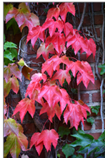
Boston Ivy in fall