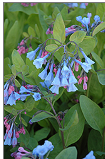
Virginia Bluebells flowers