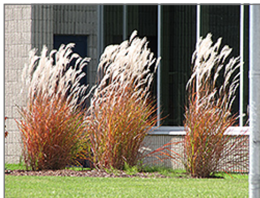
Flame Grass in bloom