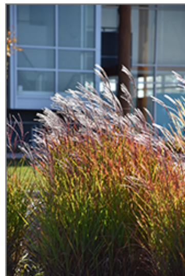
Flame Grass fruit

This plant does best in full sun to partial shade. It prefers to grow in average to moist conditions, and shouldn't be allowed to dry out. It is not particular as to soil type or pH. It is highly tolerant of urban pollution and will even thrive in inner city environments. This is a selected variety of a species not originally from North America. It can be propagated by division; however, as a cultivated variety, be aware that it may be subject to certain restrictions or prohibitions on propagation.