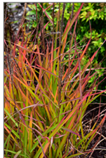
Flame Grass in fall