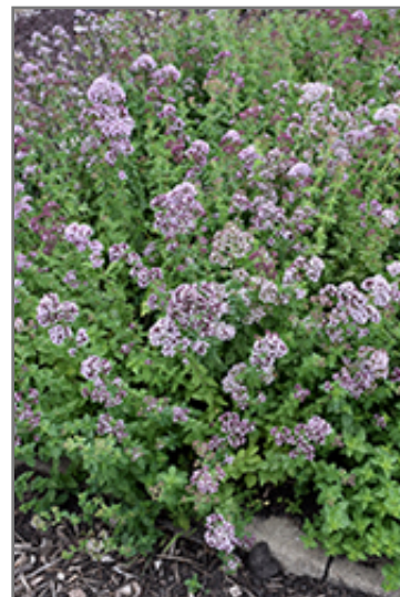
Oregano flowers