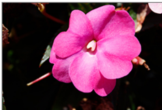
SunPatiens Compact Hot Pink New Guinea Impatiens flowers

SunPatiens Compact Hot Pink New Guinea Impatiens is recommended for the following landscape applications;