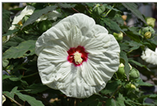
Summerific French Vanilla Hibiscus flowers

Summerific French Vanilla Hibiscus is recommended for the following landscape applications;